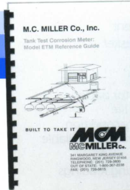
TANK TEST KIT MANUAL*