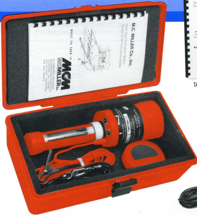
CAT. NO. 4108