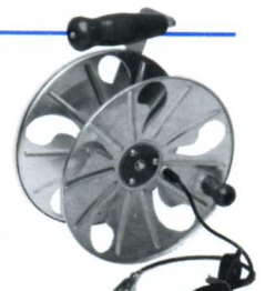
AGRA Reel (Wire supplied separately) #30501