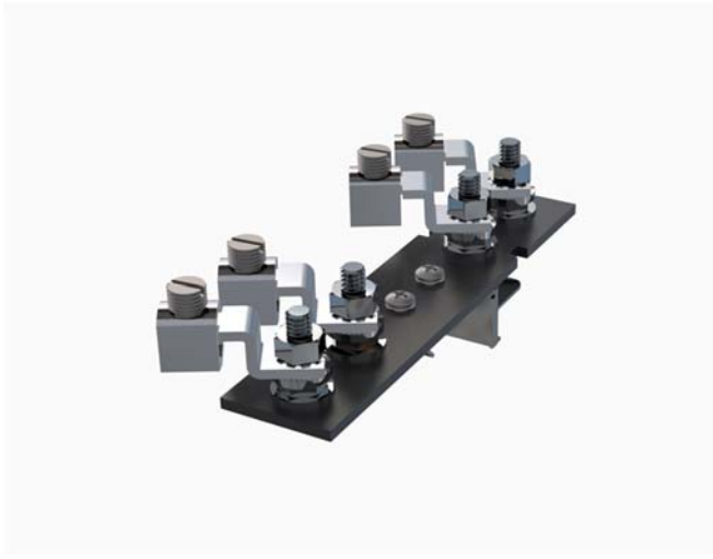
Example of terminal module, above

be added, removed, or changed to a different version of any component. Any change can be made with the cables left in place. All shunt modules are offered with commonly specified shunts and all resistor modules are offered in commonly specified wattage and resistance values. All modules are offered with one shunt or one resistor per module, but very common shunts types and resistor ratings are also offered with two shunts and two resistors per module, for efficiency. Other modules offered are two isolated terminals modules for potential measurements or to facilitate span tests (where the pipeline itself is used as a shunt); one with four terminals and one with eight terminals. These modules can be mounted to the same DIN rails on which shunts and resistor are mounted or they can be mounted directly to the struts to which DIN rails are attached using a separate kit with a very short section of DIN rail. Another module offered contains a blank resistor core that can be used as a form so that a user can wind their own nichrome wire resistor on site.