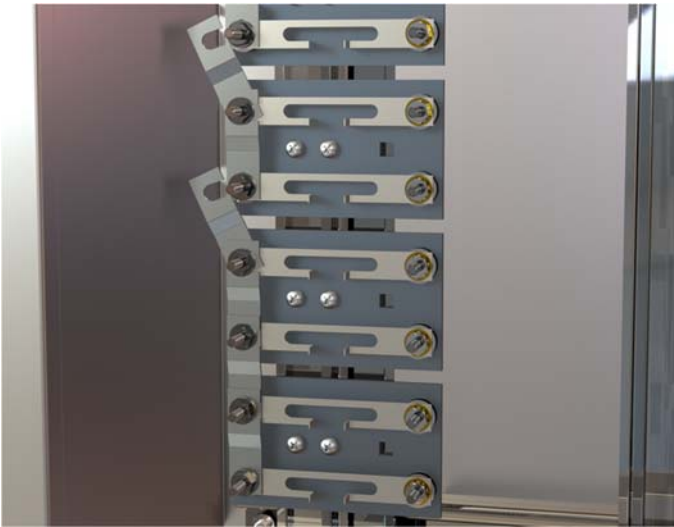
Example of moveable links on left, connecting multiple JB shunts

The Ultra Box is a very user friendly alternative to existing junction box designs due to the highly flexible modular design approach. When multiple shunts are to be connected in parallel, a very common requirement, it is done with movable links that join adjacent shunts and are secured with a flange nut on each end. When these nuts are loosened, the link can be pivoted out of the way to remove or change a shunt but the link is always retained in the process. The Ultra Box is expected to meet requirements that are normally specified by users for junction boxes.